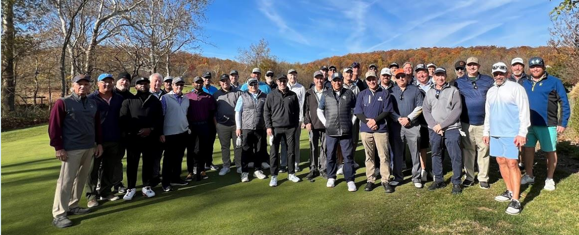
Pen Pushers of America 200 th Event will be held at Loudoun Golf and Country Club, August 8 th , 2024

Welcome to the Pen Pushers of America's 23 rd season. It is hard to believe that our Irish Open in March will be our 195 th event since we started this golf society. We hope to see everyone at our first event of the season, the Irish Open, March 20 th , at Westfields Golf Club. ...And the Big News for this season is that we will be holding our Pen Pushers of America 200 th event in August at Loudoun Golf and Country Club. We will definitely be doing something very special for our members to celebrate that event.