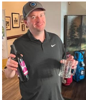
2023 Autumn Challenge Ross Charles (No Photos)